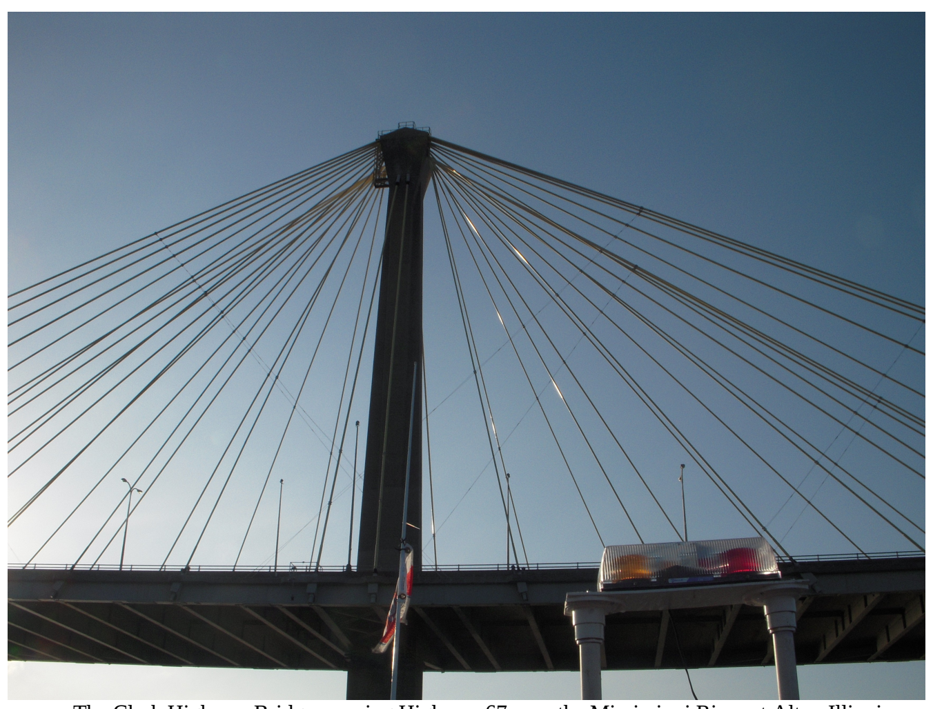
The Clark Highway Bridge carrying Highway 67 over the Mississippi River at Alton Illinois