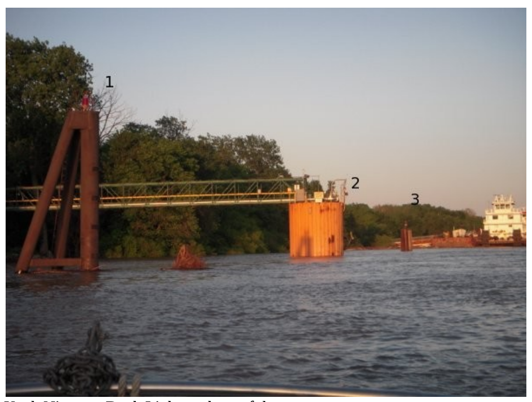
The Koch Nitrogen Dock Lights – three of them