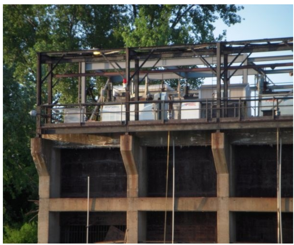
The water intake for the Illinois Power Company power plant near Alton Illinois